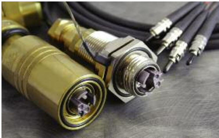
TFOCA-II® EX Plug & Receptacle